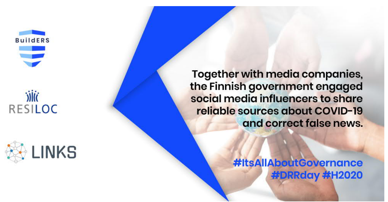
Figure 3: Online campaign for DRR day, example

The blog is regularly updated (once or twice per month) with fresh content provided by the partners with the goal to inform the audiences about BuildERS' topics such as resilience, risk awareness, vulnerability, etc. Each blog post is carefully prepared, discussed and aligned with the project objectives and other international or European initiatives. For instance, for the International Day for Disaster Risk Reduction scheduled each October, BuildERS, RESILOC and LINKS joined the international campaign organized by the United Nations.