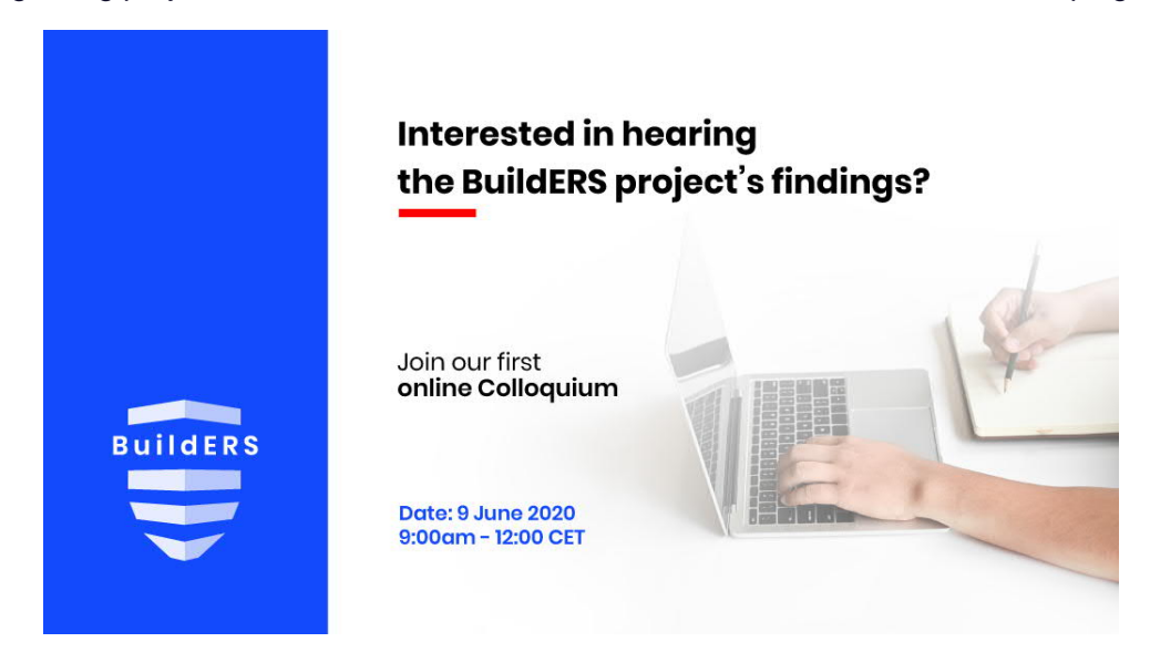
Figure 5: Online dissemination material, example 1

Additionally, various online communication and dissemination materials have been developed and shared regarding project's online events, communication activities and awareness campaigns.