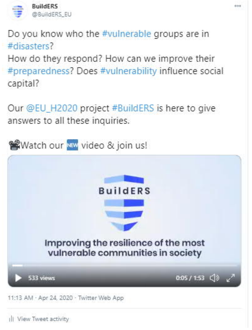
Figure 4. Announcement of the video on social media

Also, BuildERS launched its first promo video, which aimed to raise awareness and communicate the objectives of the project to the public. The video has been published on different platforms including BuildERS website and social media channels and was shared by our partners.