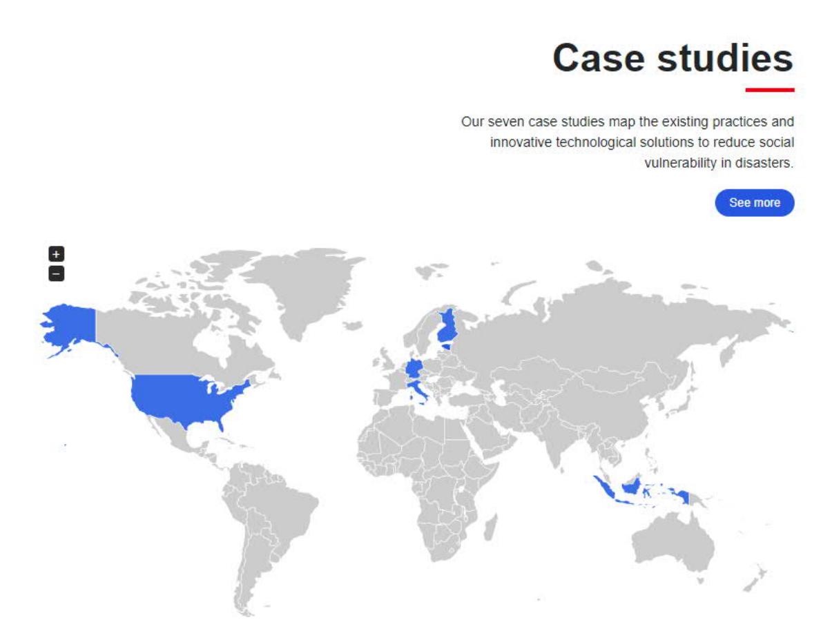
Figure 2. Overview BuildERS website - case studies

Furthermore, the new "Case Studies" section has been designed to feature the project's case studies using a modern and interactive map. The visitors will be able to click on the different countries and get additional knowledge on the existing practices and innovative technological solutions to reduce social vulnerability in disasters. This interactive map is visible below: