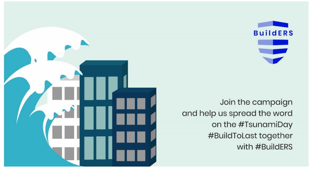
Figure 7: Online dissemination material, example 3