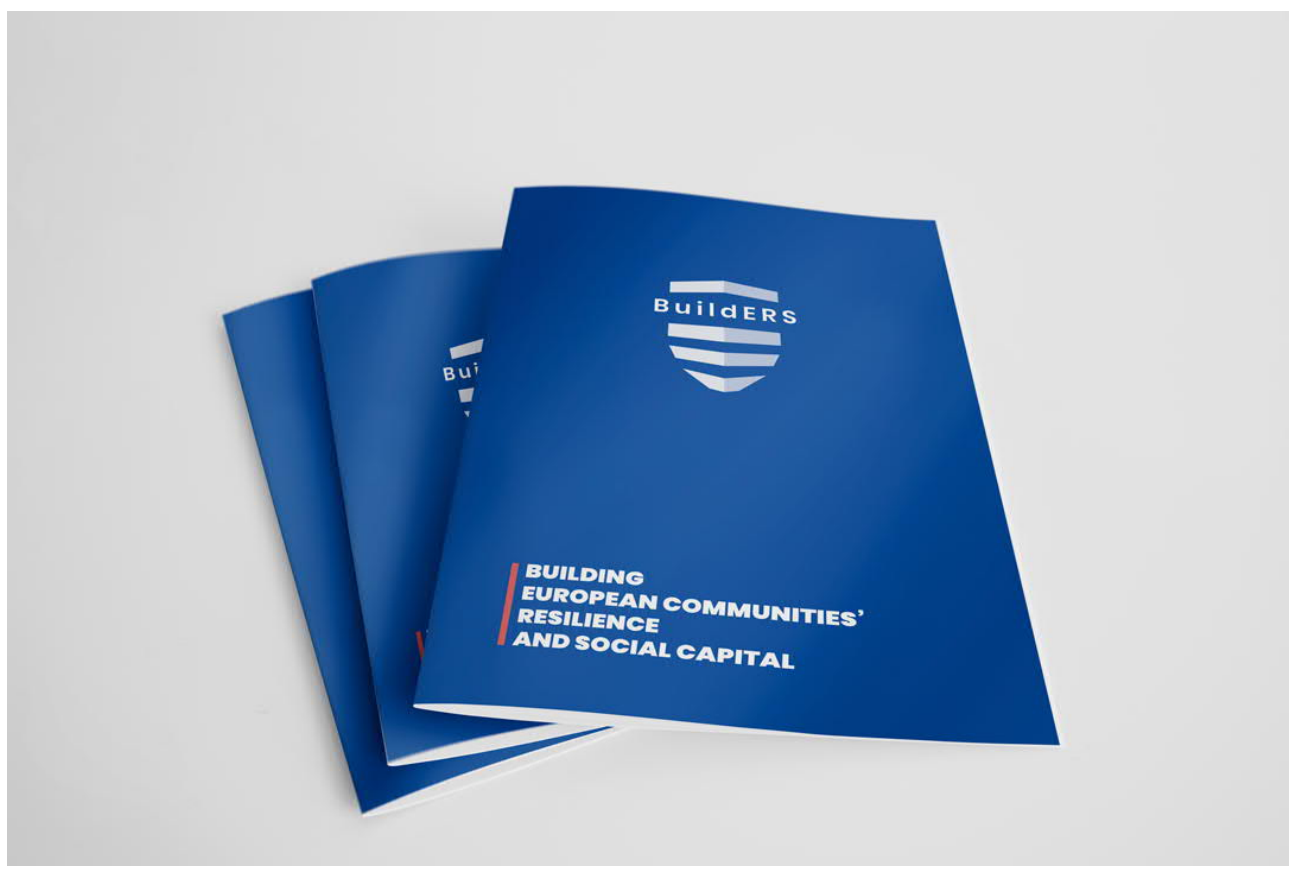
Figure 8. Overview BuildERS brochure (mock-up)

BuildERS will prepare brochures and fact sheets to disseminate project's key research findings to local stakeholders and civil society organizations, for example: first responders and security practitioners, European networks of crisis management professionals and relevant media, as well as elderly homes, rehabilitation centres, homeless centres, soup kitchens, etc. These materials are planned to be translated into German, Italian and Finnish languages to forward the message into the languages of our target groups.