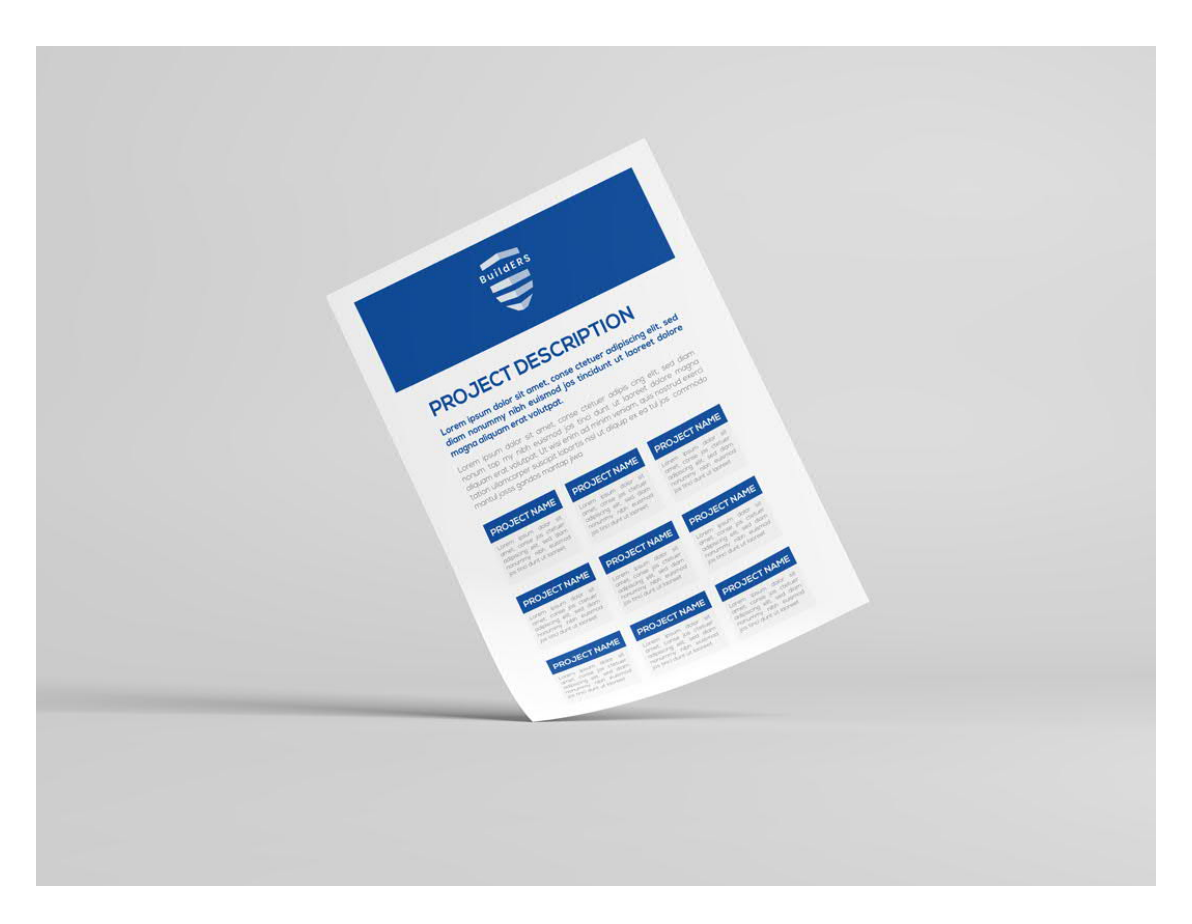
Figure 9. Overview BuildERS fact sheet (mock-up)